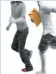
[title of show]

HHC Marketing works with some of Broadway and Off-Broadway's hottest shows including Spamalot , Jersey Boys , Xanadu , Altar Boyz and our newest musical, [title of show]. Yes, [title of show] is the actual name of the show. And, HHC would like to extend an offer of a 50% discount to all the members of the NYSTA! [title of show] is about having a dream and truly pursuing it. From the producers of Rent and Avenue Q , [title of show] was an off Broadway hit at the Vineyard Theater and tells the story of its own creation. It takes a thoroughly unique and comical look at the pleasures and perils of the artistic process as two struggling writers and two struggling actresses take on the seemingly impossible task of creating a new musical about creating a new musical. This funny and unforgettable look at how a musical is brought to life, comes to life itself on the Great White Way. [title of show] is currently playing at the Lyceum Theatre, 149 W. 45 th St. For more information on the show, please visit www.titleofshow.com .